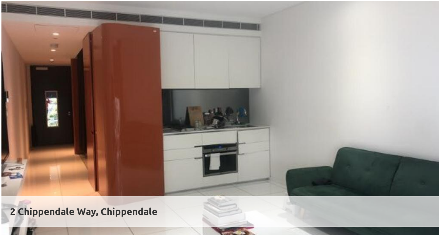
2 Chippendale Way, Chippendale