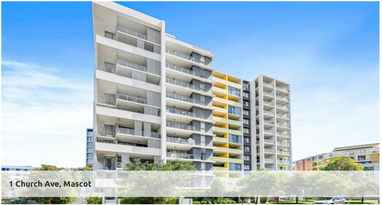
1 Church Ave, Mascot