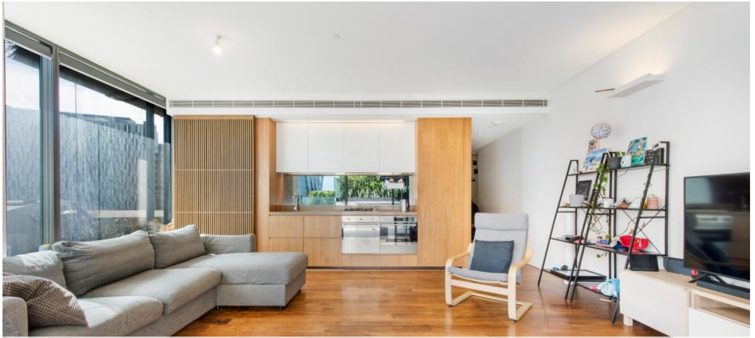
E503, 3 Carlton St, Chippendale