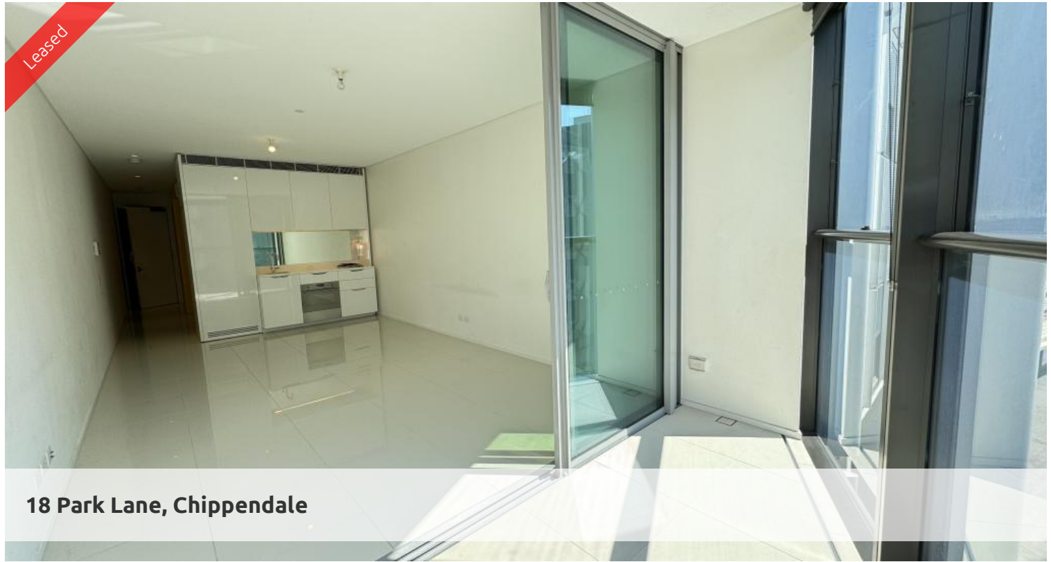
18 Park Lane, Chippendale