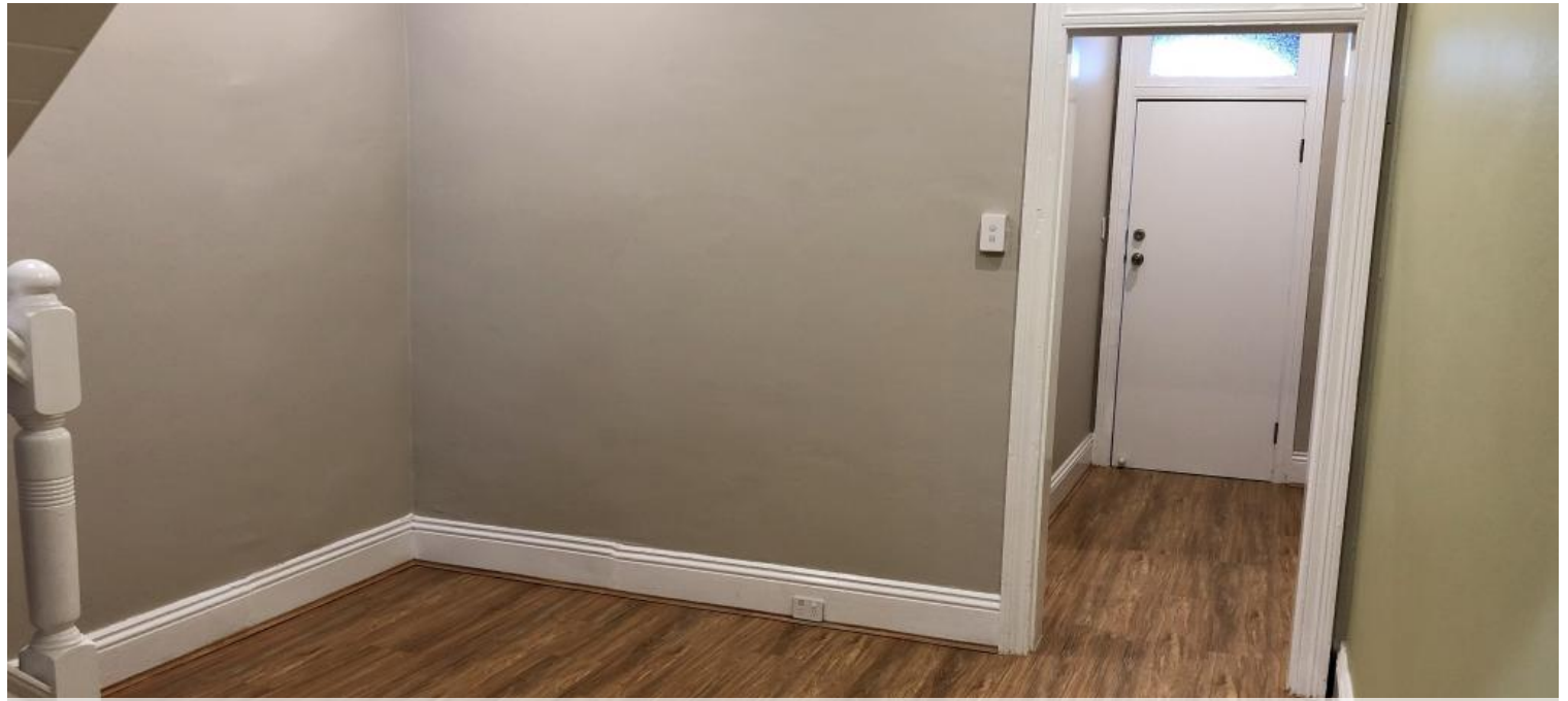
88 Campbell St, Surry Hills