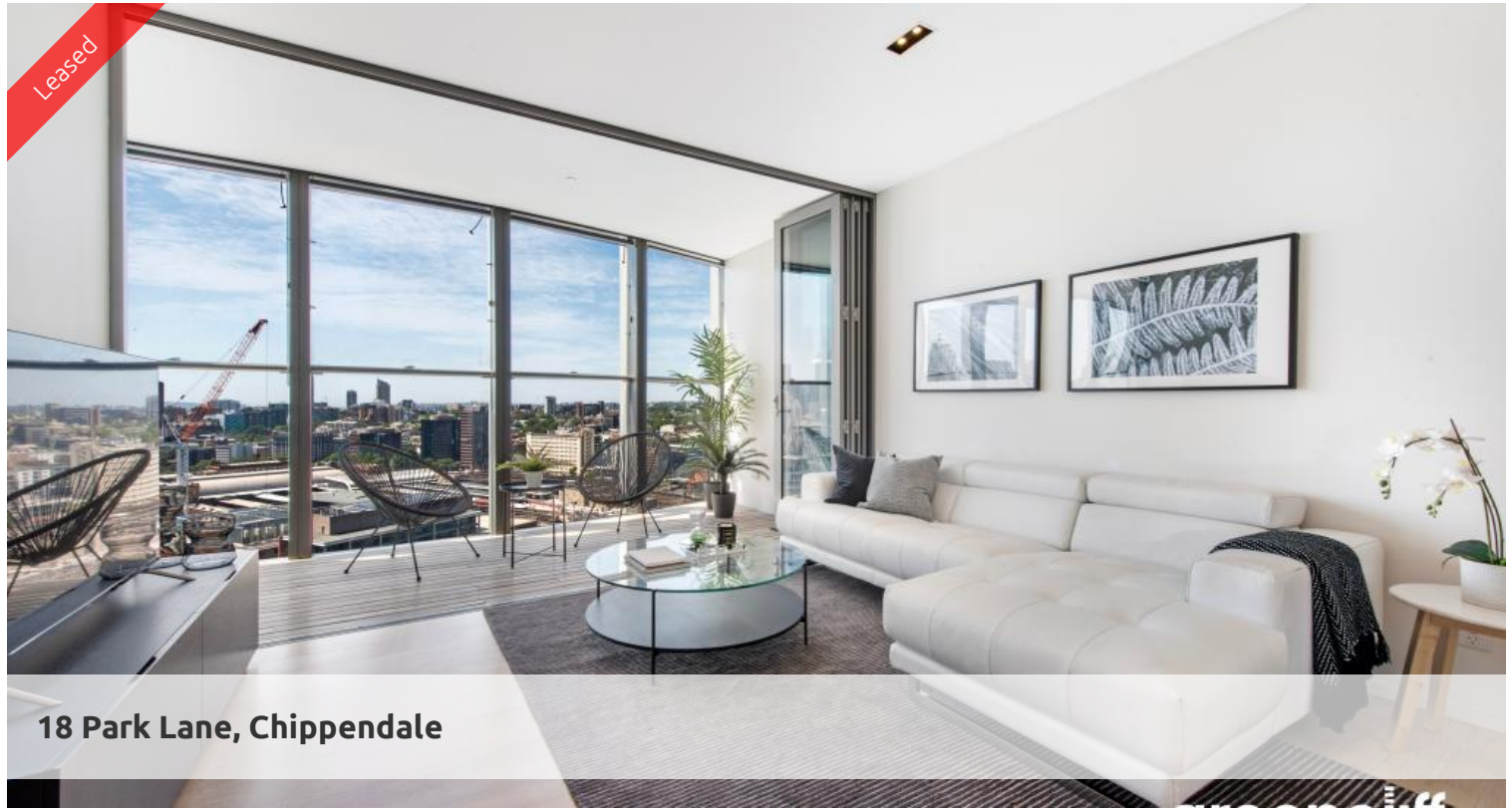
18 Park Lane, Chippendale