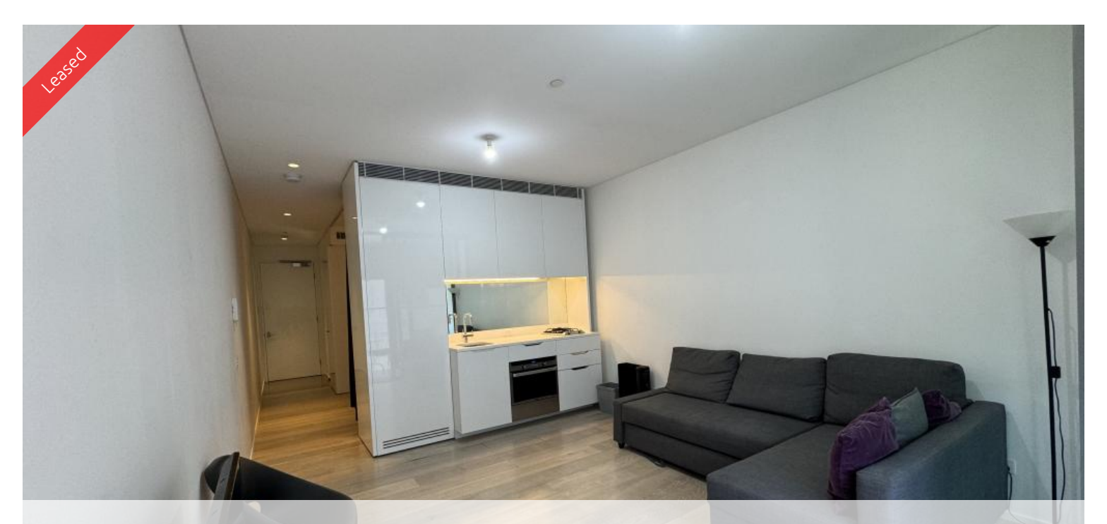
18 Park Lane, Chippendale