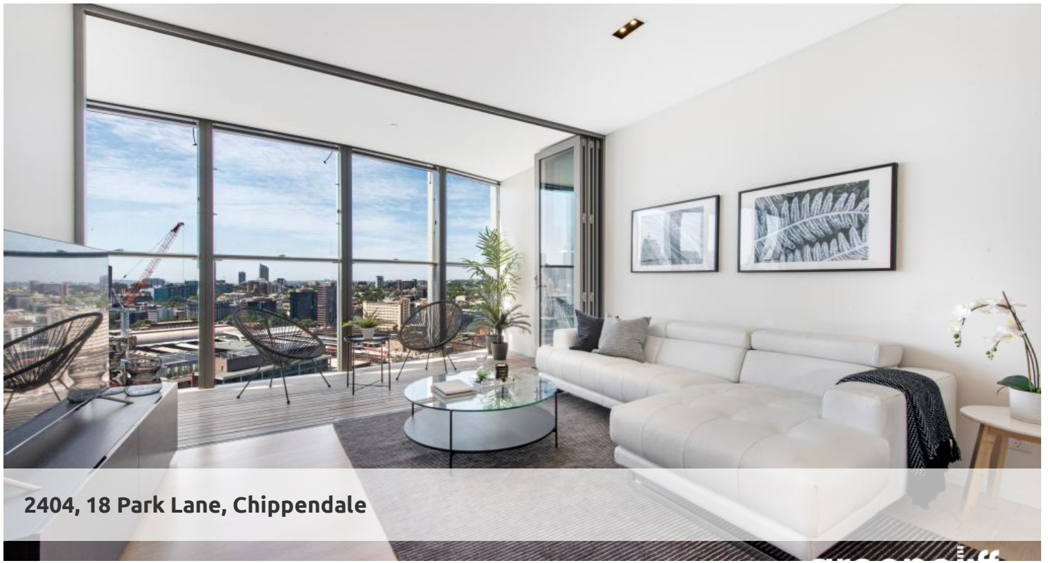
2404, 18 Park Lane, Chippendale