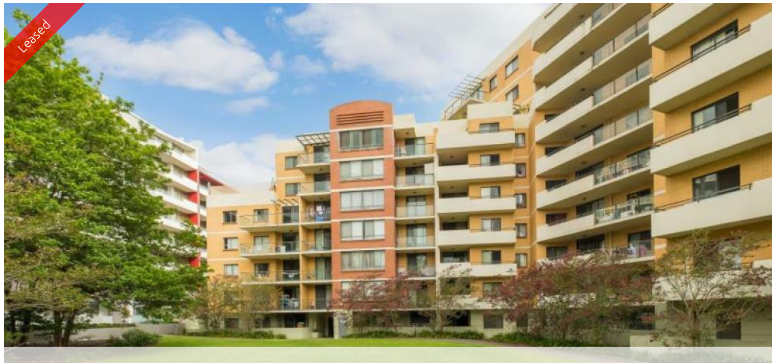
50, 1-3 Clarence St, Strathfield