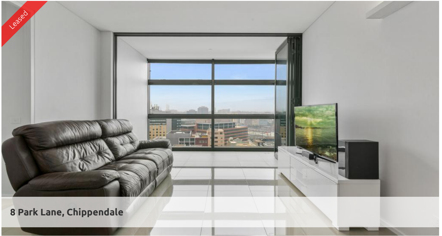
8 Park Lane, Chippendale