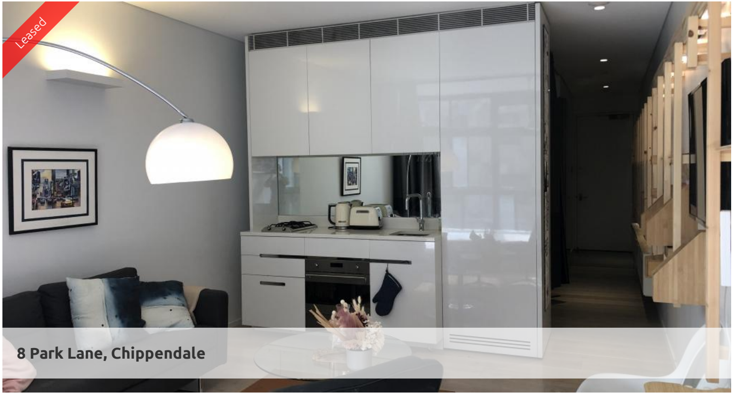
8 Park Lane, Chippendale