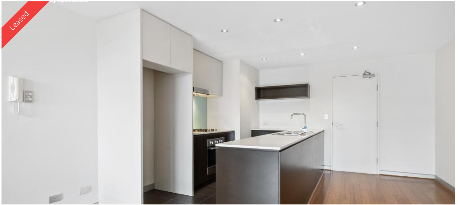
M403, 68 Mcevoy St, Alexandria