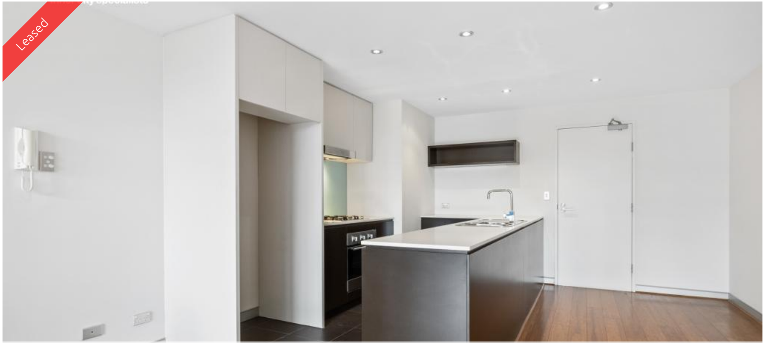
M403, 68 Mcevoy St, Alexandria