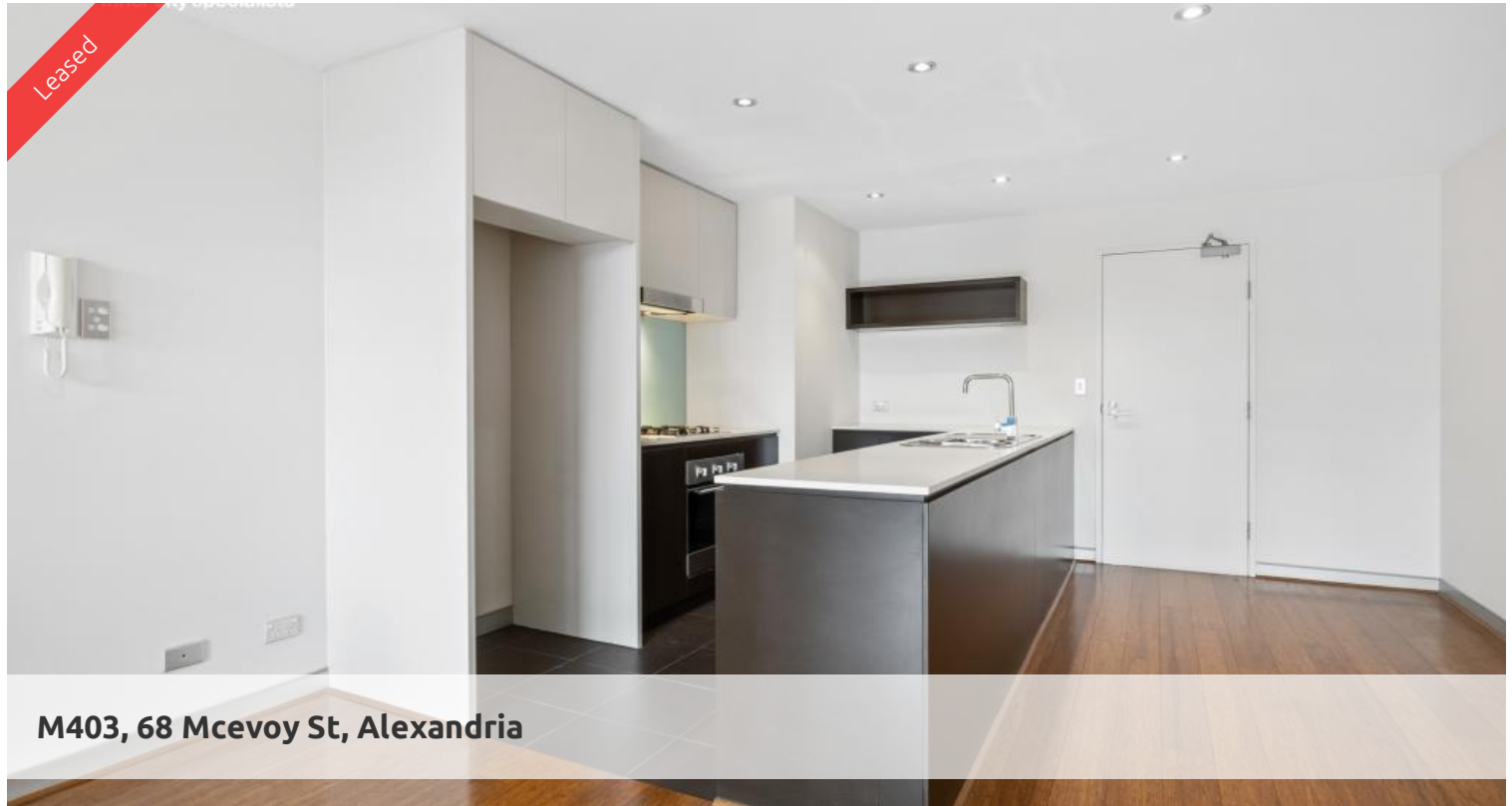
M403, 68 Mcevoy St, Alexandria