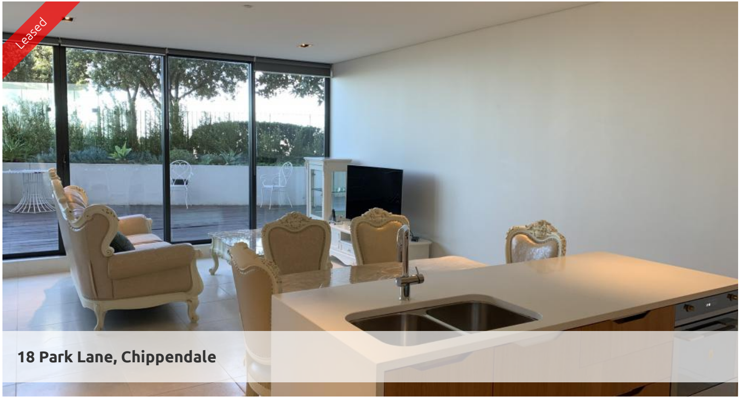
18 Park Lane, Chippendale