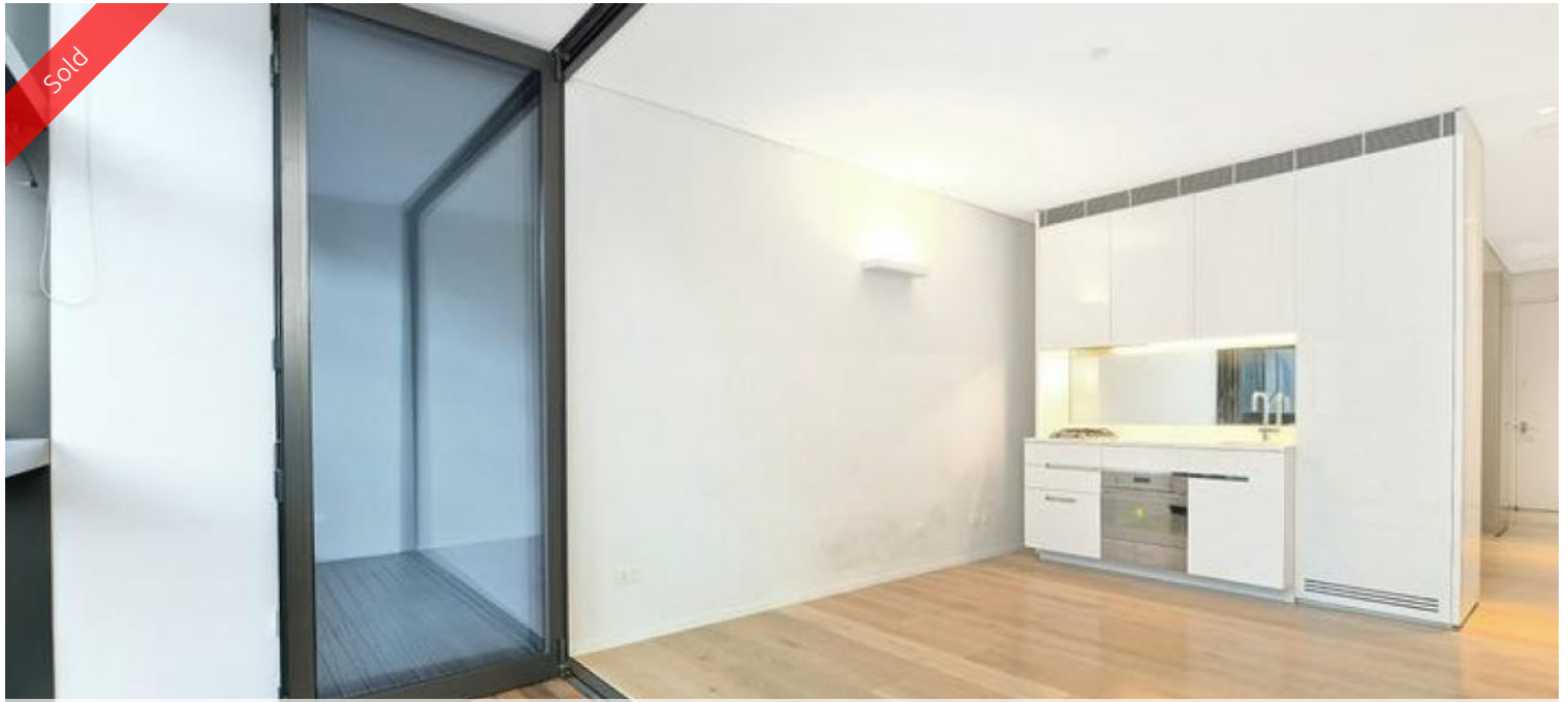
708, 8 Park Lane, Chippendale