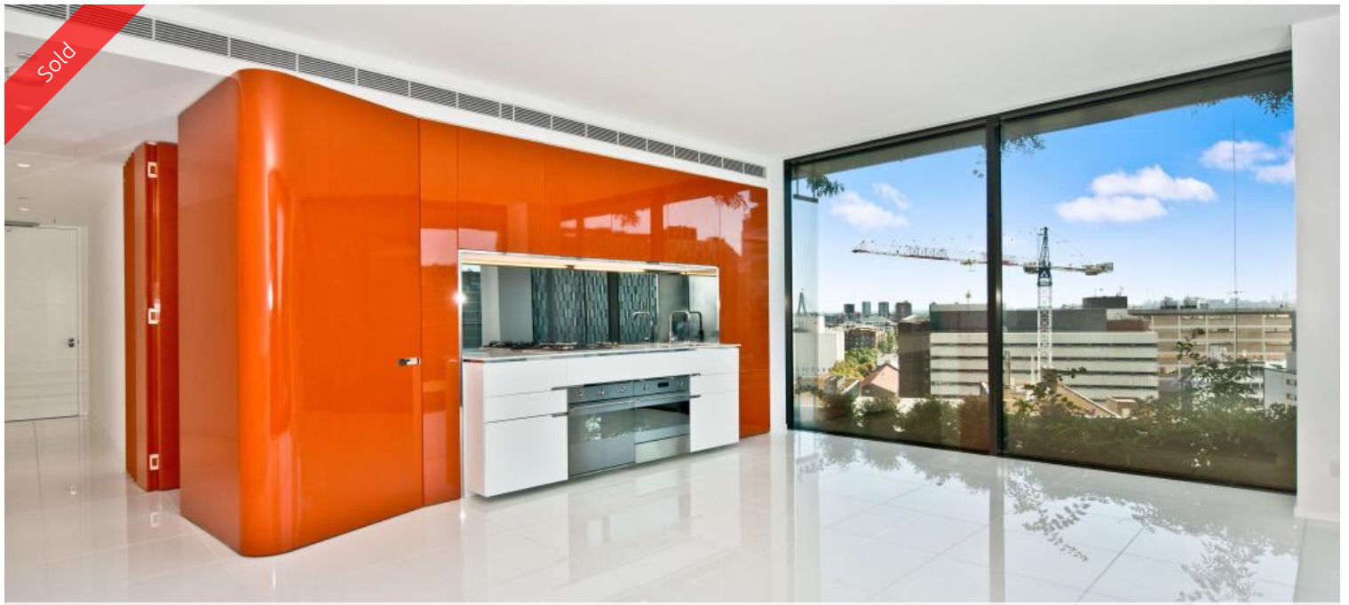
W 817, 2 Chippendale Way, Chippendale