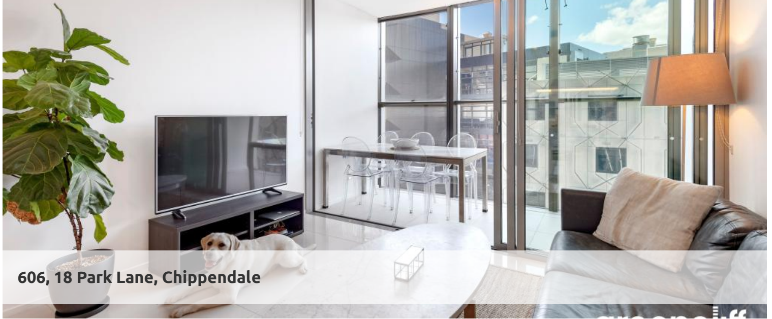
606, 18 Park Lane, Chippendale