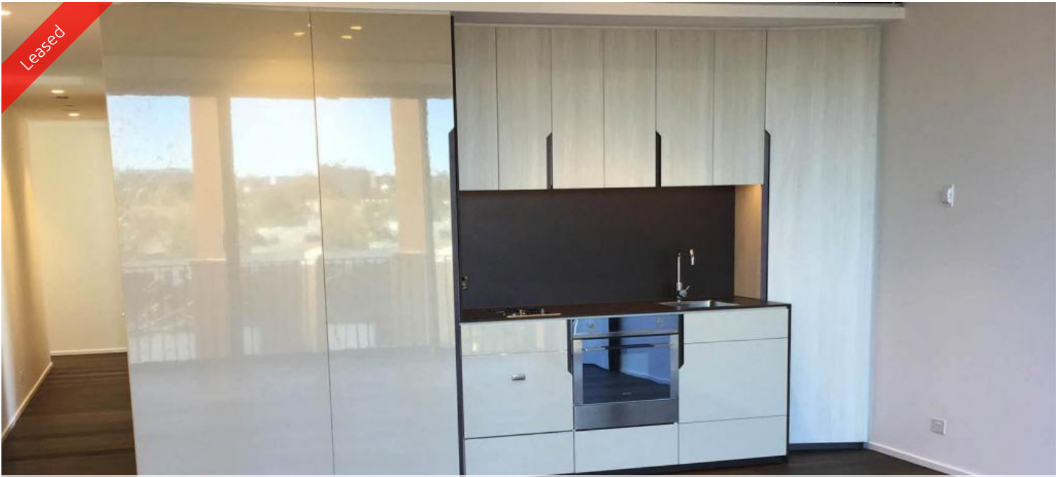
8 Central Park Ave, Chippendale