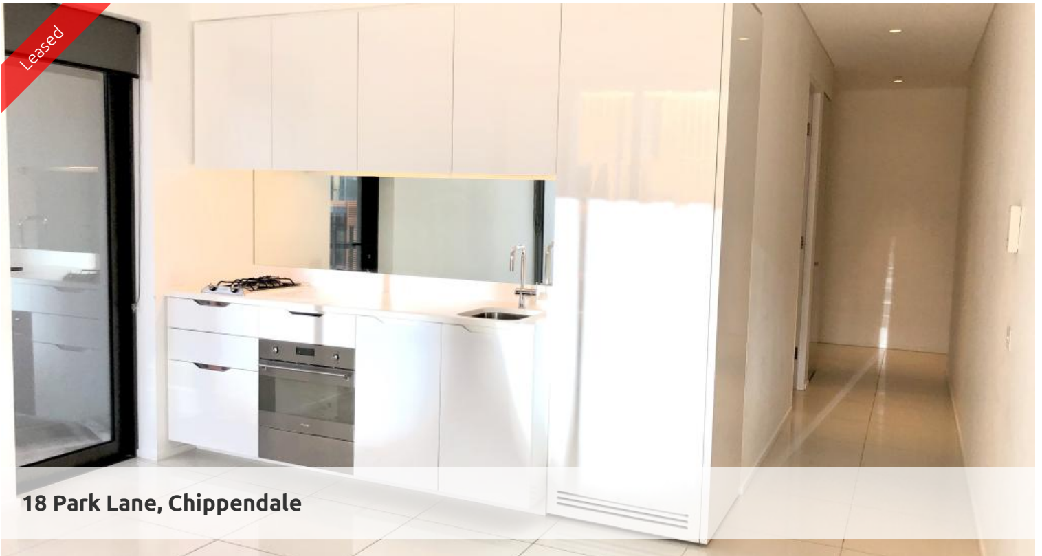
18 Park Lane, Chippendale