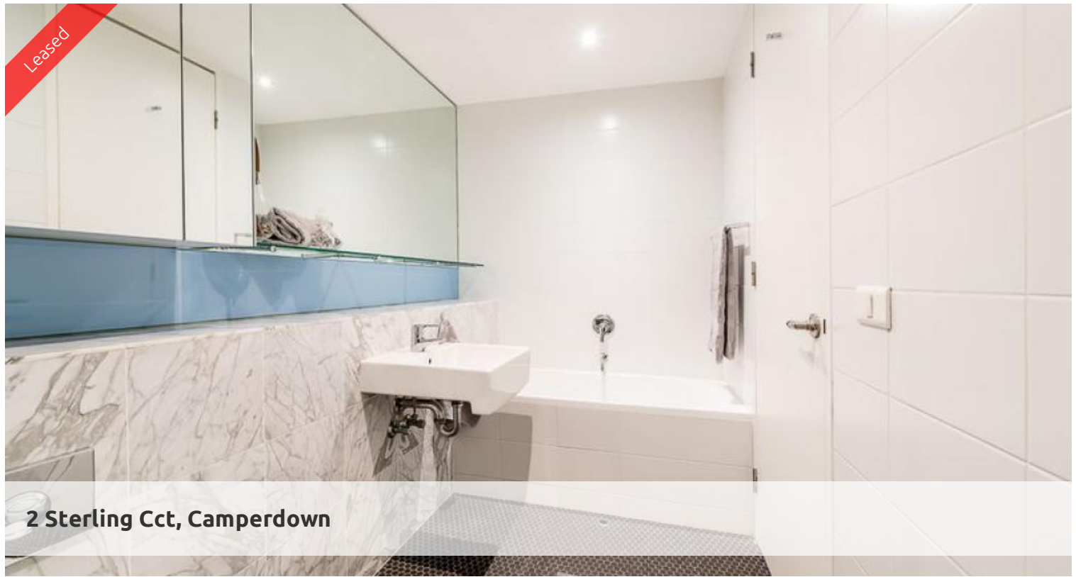
2 Sterling Cct, Camperdown