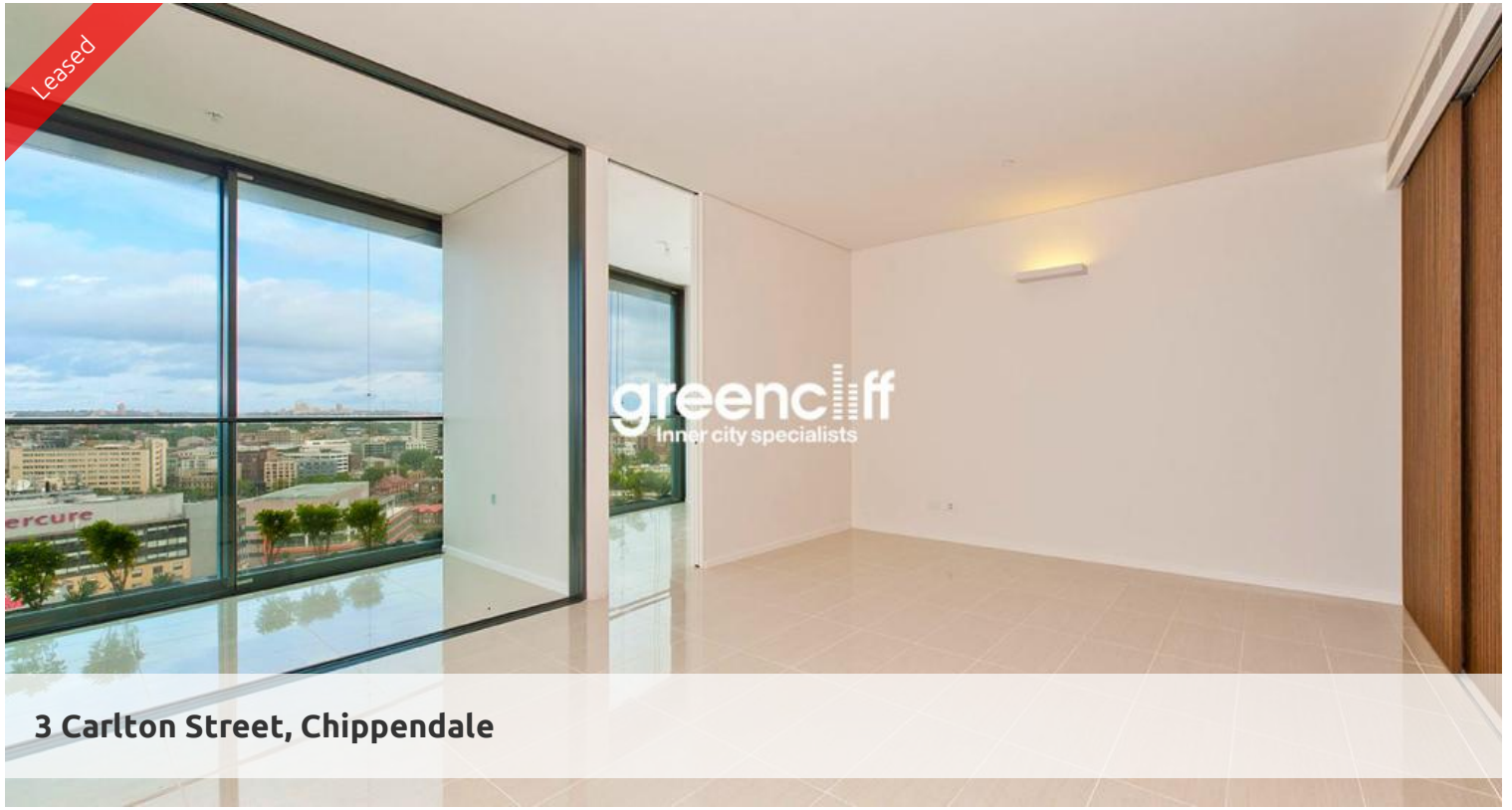
3 Carlton Street, Chippendale