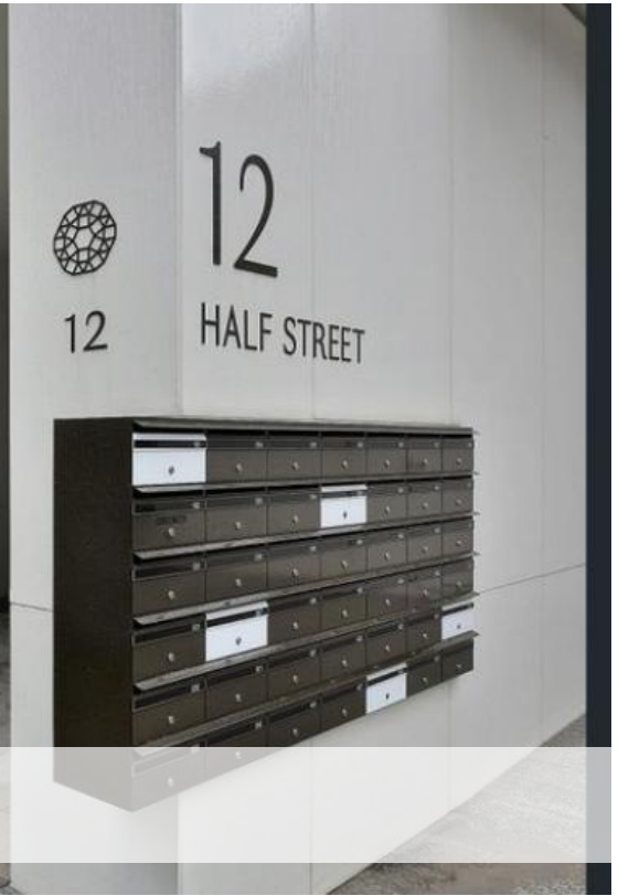
Unit 403, 12 Half St, Wentworth Point