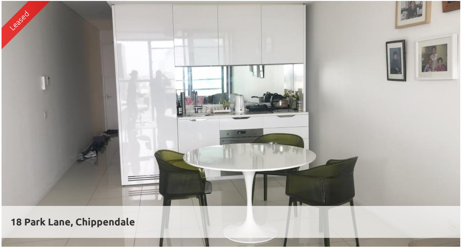
18 Park Lane, Chippendale