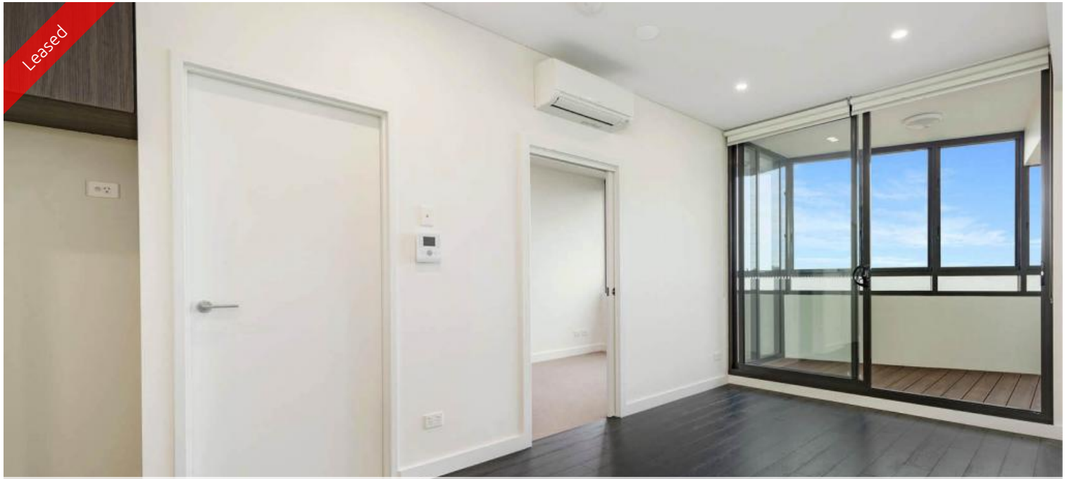
1 Wharf Rd, Gladesville