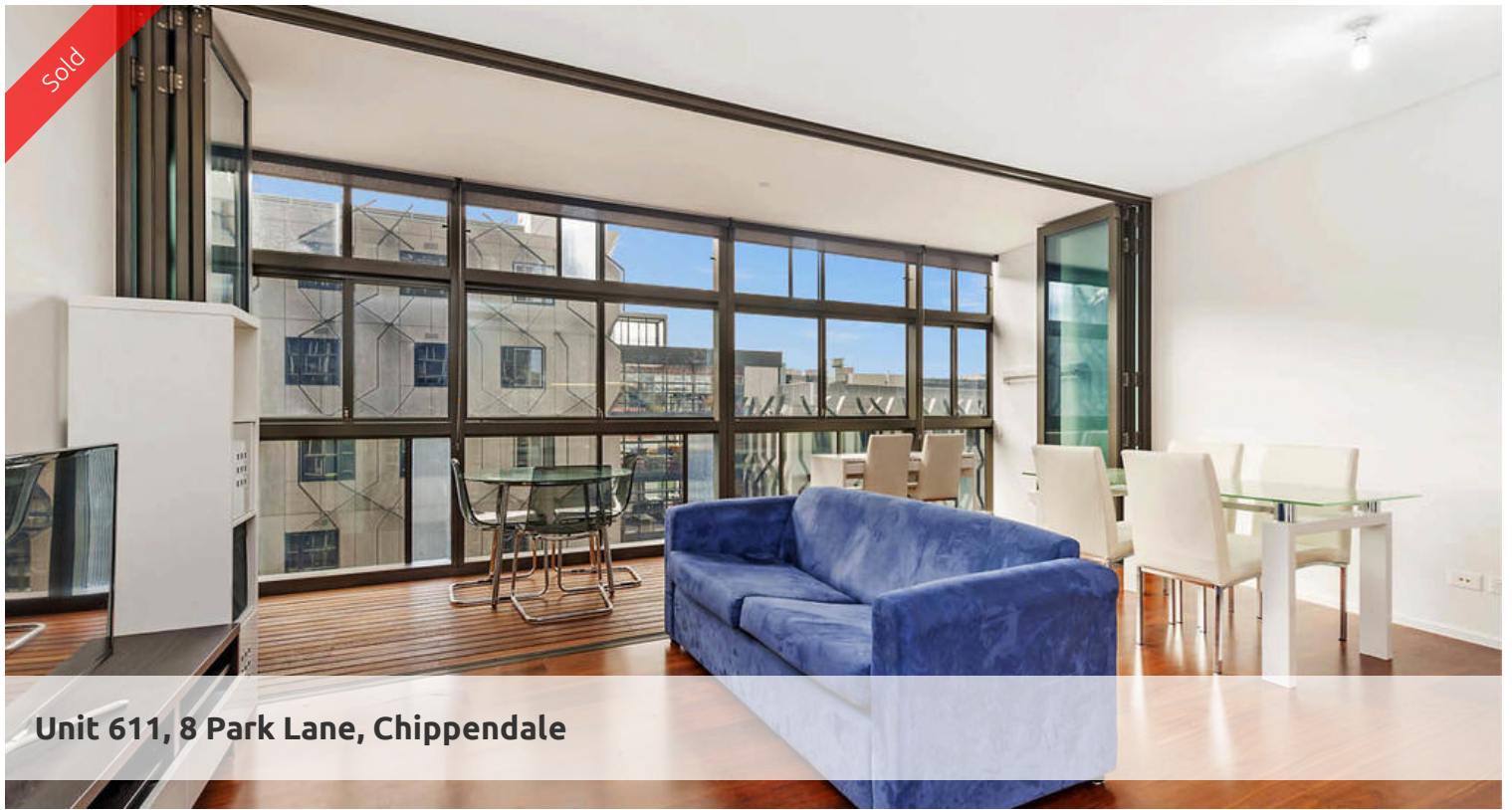
Unit 611, 8 Park Lane, Chippendale