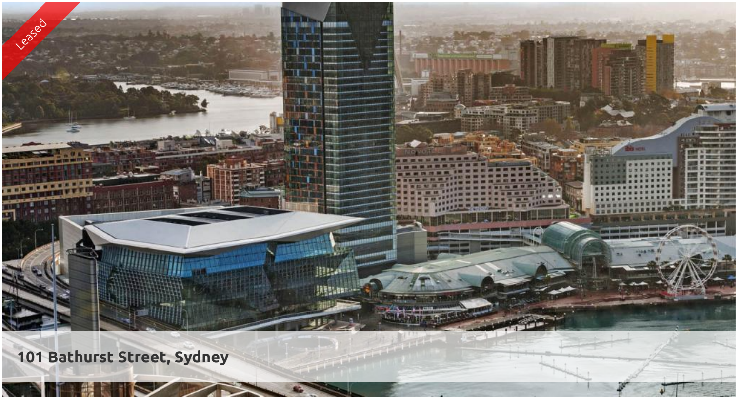
101 Bathurst Street, Sydney