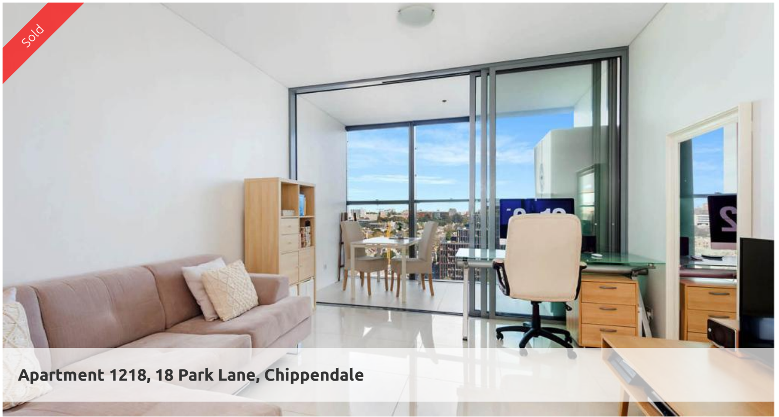
Apartment 1218, 18 Park Lane, Chippendale