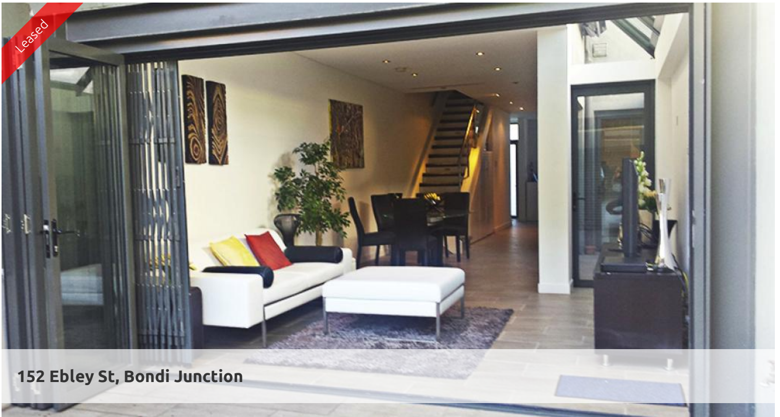
152 Ebley St, Bondi Junction