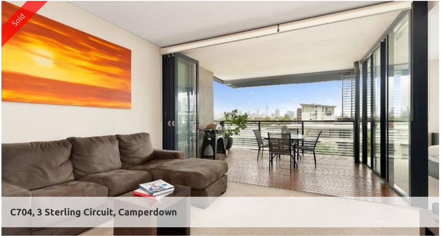
C704, 3 Sterling Circuit, Camperdown