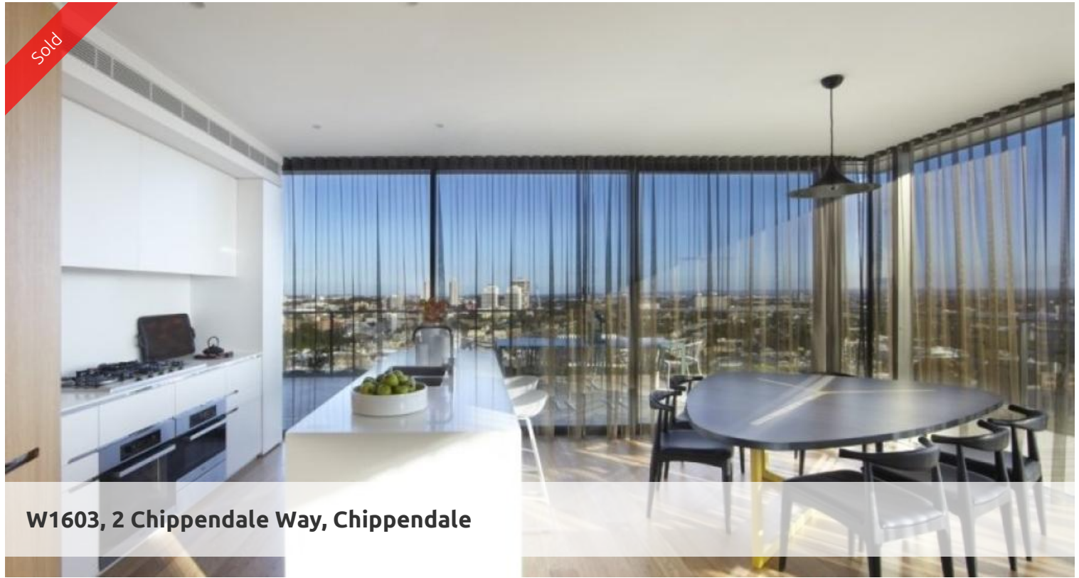
W1603, 2 Chippendale Way, Chippendale