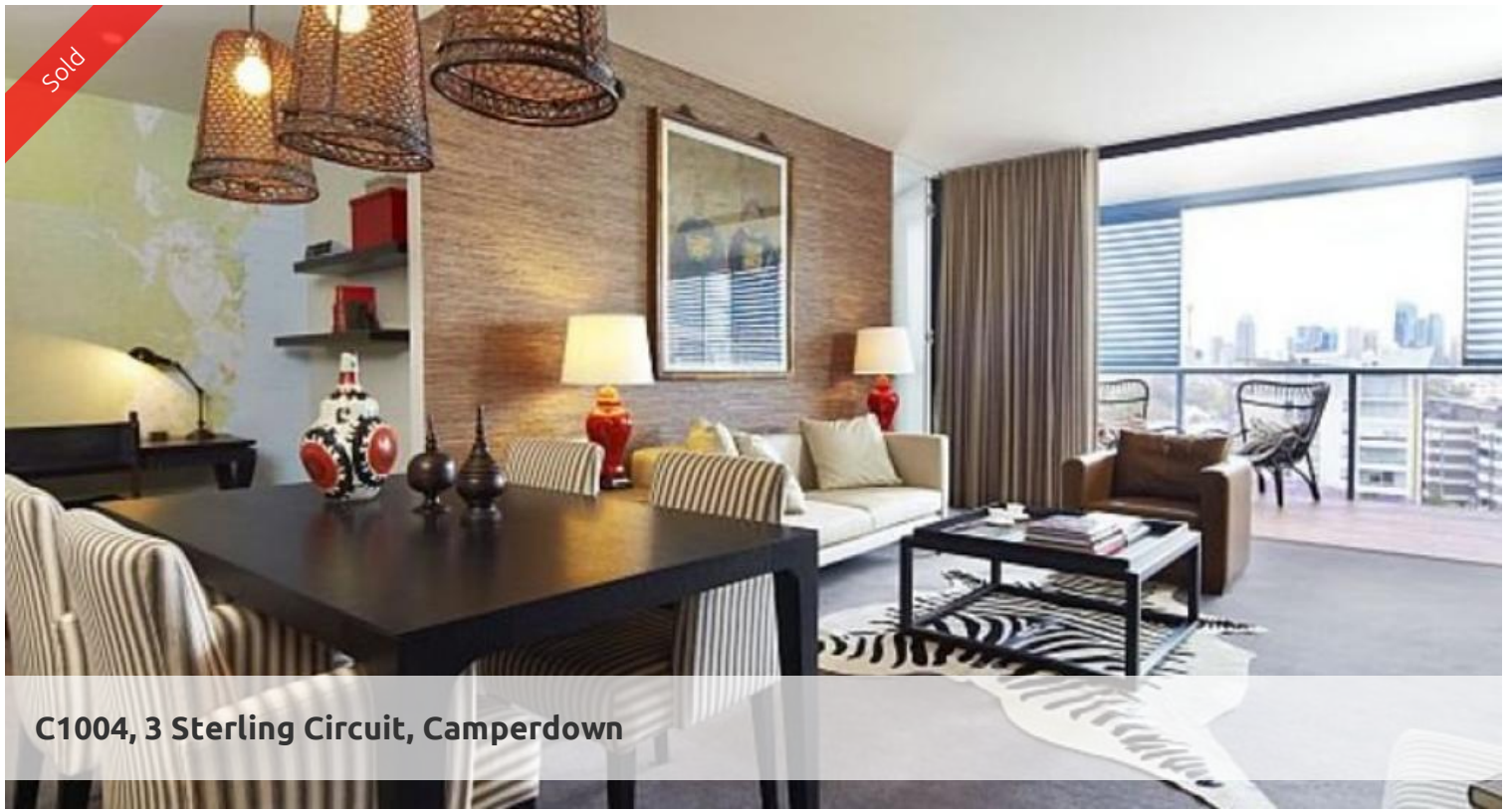
C1004, 3 Sterling Circuit, Camperdown