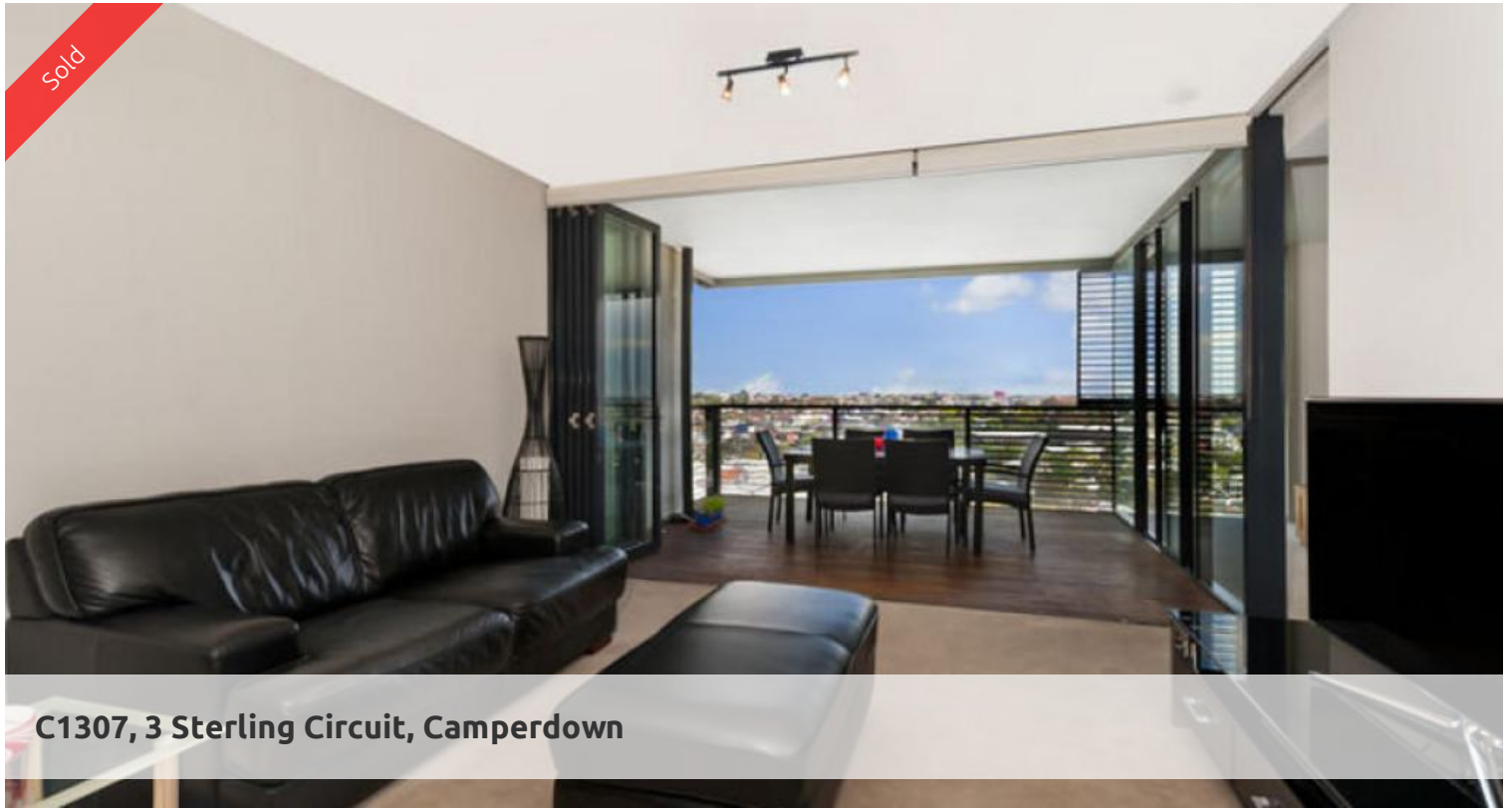
C1307, 3 Sterling Circuit, Camperdown