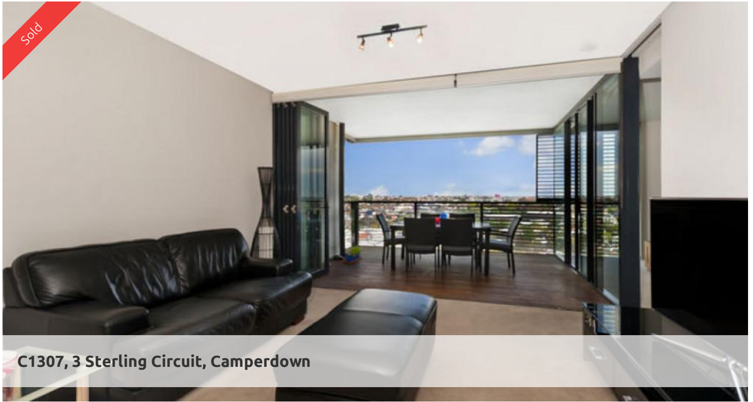
C1307, 3 Sterling Circuit, Camperdown