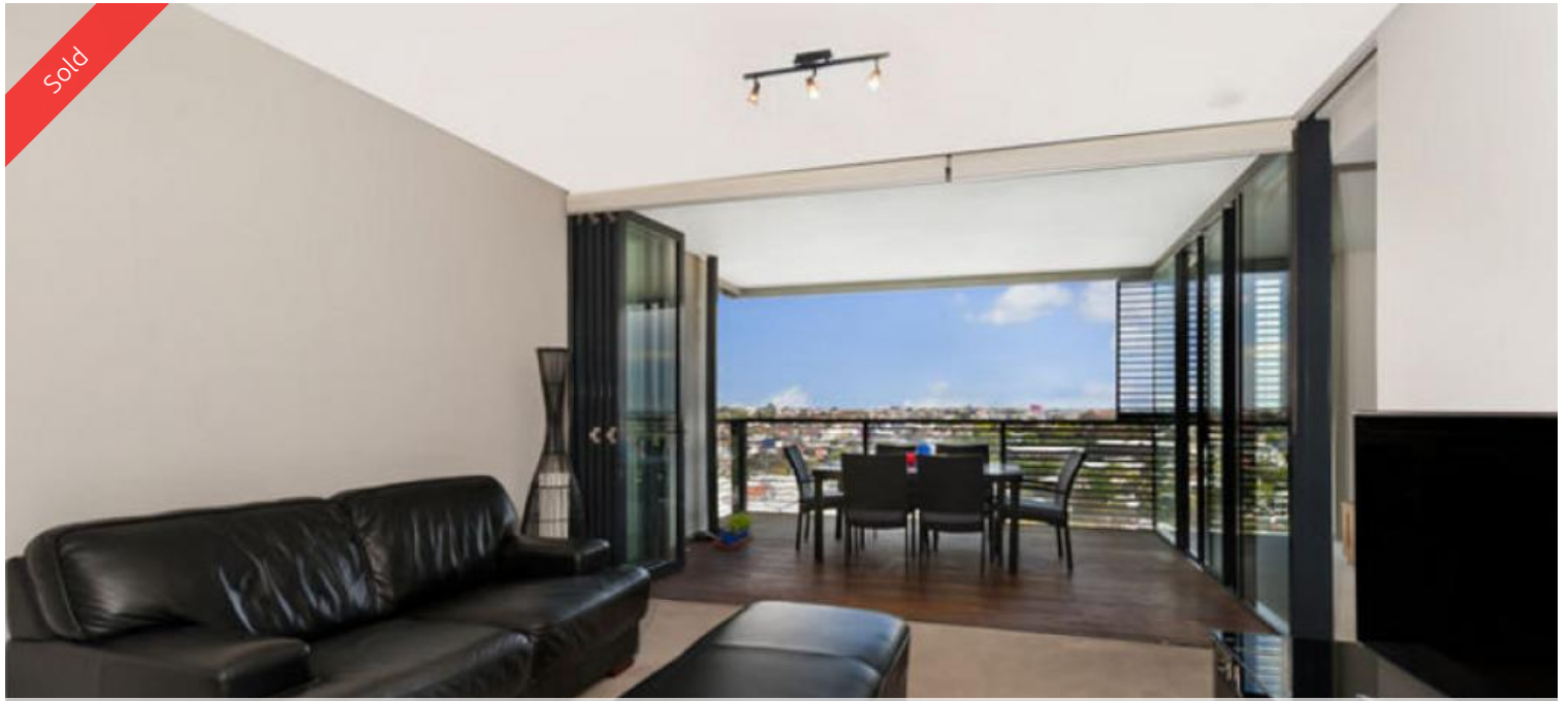
C1307, 3 Sterling Circuit, Camperdown