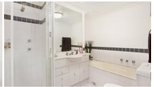
105/30 NOBBS ST, SURRY HILLS Floorplan by Onry Real Estate Ph: 1300 760 390