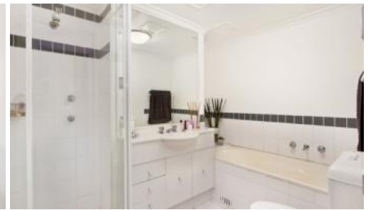
105/30 NOBBS ST, SURRY HILLS Floorplan by Orby Real Estate Ph: 1300 760 390