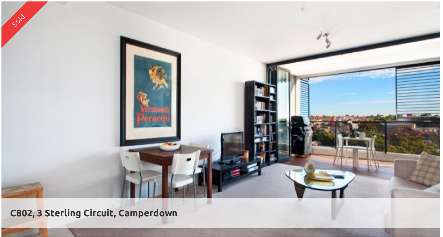
C802, 3 Sterling Circuit, Camperdown