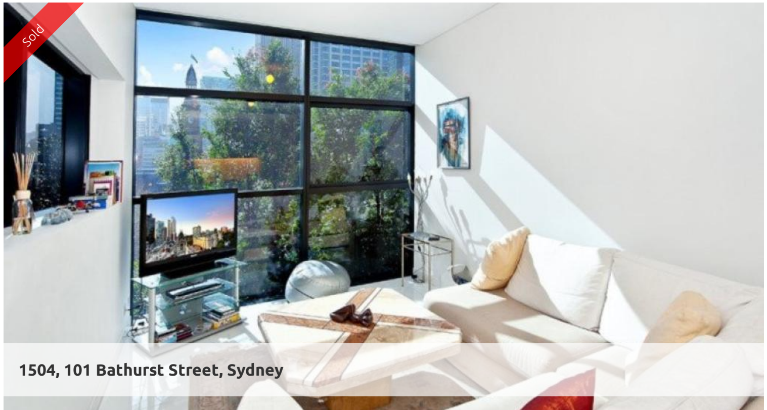
1504, 101 Bathurst Street, Sydney