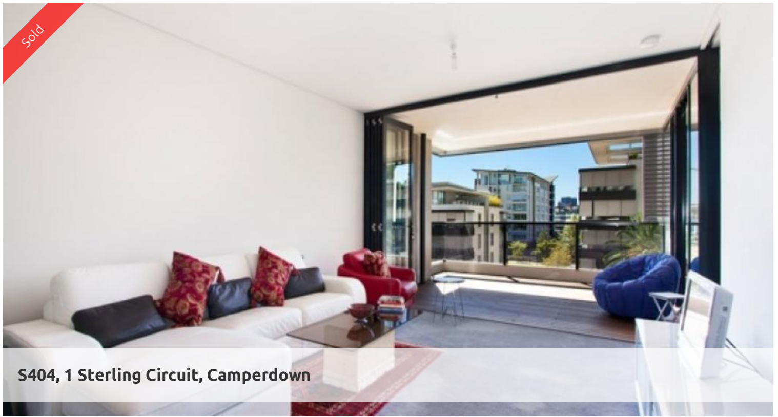
S404, 1 Sterling Circuit, Camperdown