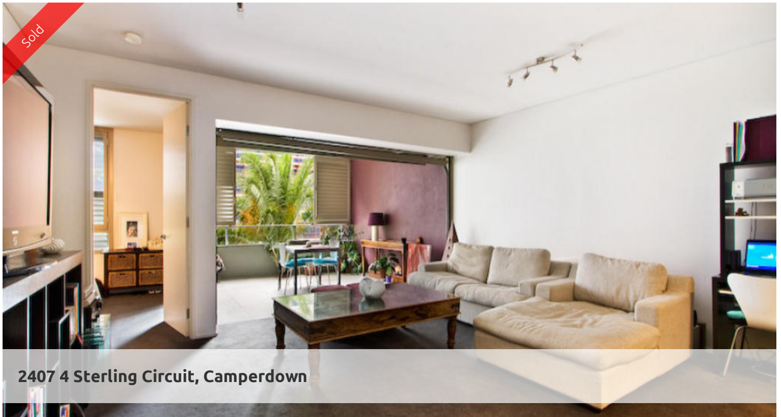
2407 4 Sterling Circuit, Camperdown