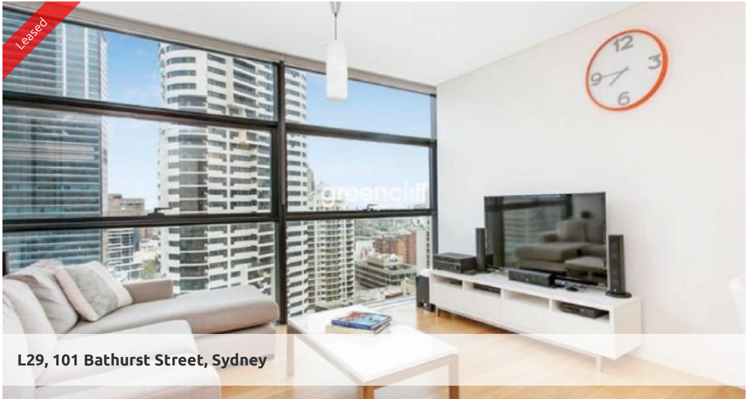
L29, 101 Bathurst Street, Sydney